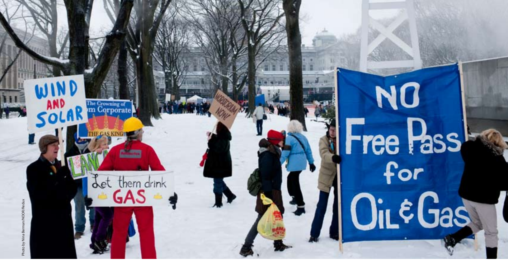
Protesters at the inauguration of Pennsylvania Gov. Tom Corbett, a supporter of natural gas exploration.