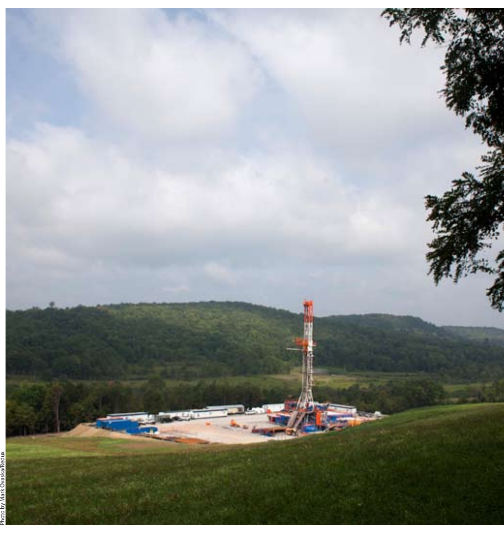
A drilling rig near Dimock, Pennsylvania, where federal regulators are investigating claims that fracking has contaminated the water.

New York is also seeing the downside: higher labor costs, pressures on the dairy in-